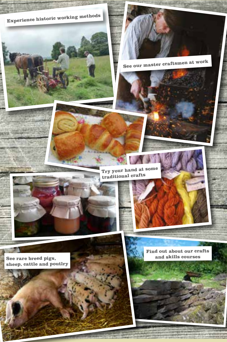
Experience historic working methods

Step back in time and enjoy a relaxing family day out exploring our 23 acres of glorious fields, farmland and historic buildings.